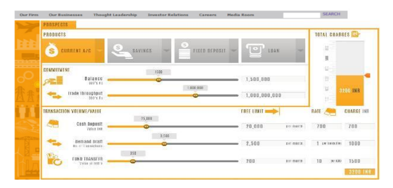
Giving control to the customer to drive their relationship with the bank