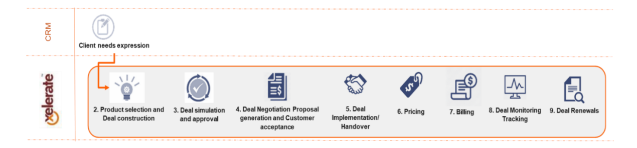
Automating the deal management cycle